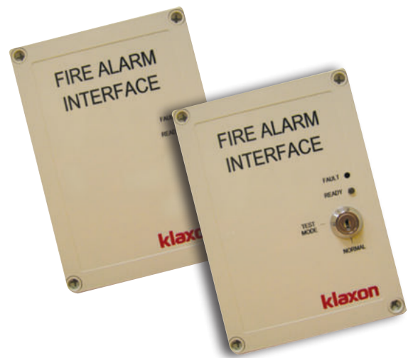
Fire Alarm System